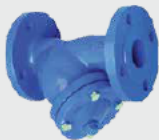
Y-Strainer (DIN 3202 F1)